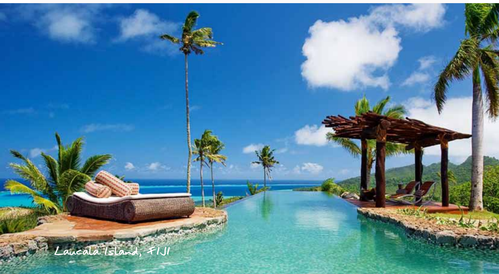
Laucala Island, Fiji

The Boyds Bay Maintenance and Refurbishment business offers a comprehensive service to maintain your asset and capital investment through:- Qualified Staff; Contracted re-establishment and maintenance; Refurbishment of built landscape environments (resorts and public space); Development and/or implementation of maintenance and monitoring programs; Sustainable and best work practices; Protection and enhancement of green assets and investments