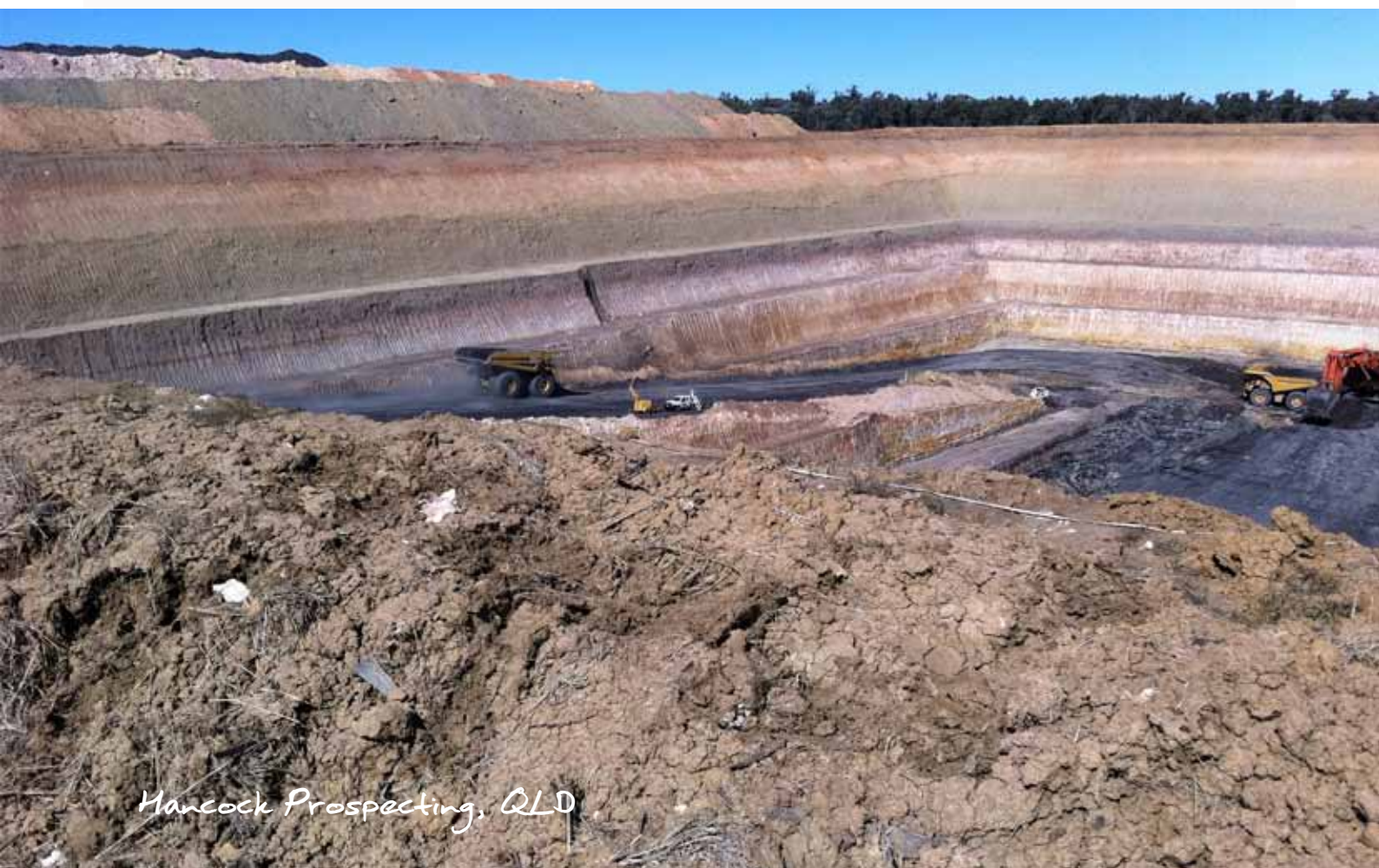
Hancock Prospecting, QLD

The resource and extractive industries produce soil based mediums that require detailed soil science and fertility management programs to create a useable resource from the excavation process. Boyds Bay Environmental involvement provided studies, amelioration treatments, seeding trials and feasibility planning for restoration works.