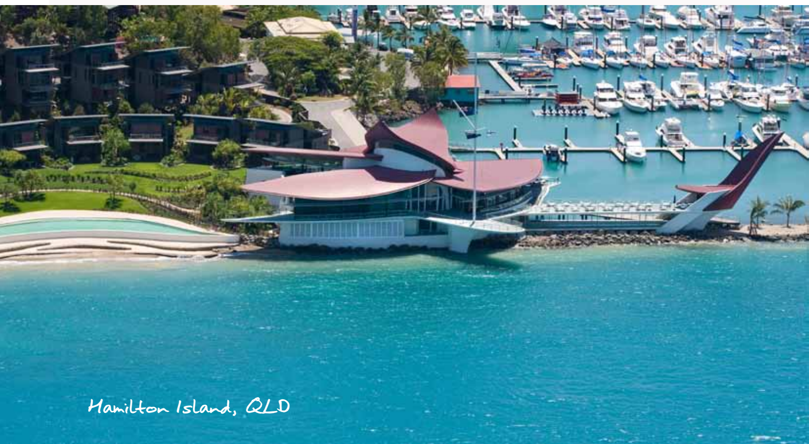
Hamilton Island, QLD

Boyds Bay Environmental provides Science, Planning and Management services for land development, mining and infrastructure projects. Boyds Bay Environmental will provide you with a range of services for smooth and seamless development approvals that maximise financial returns, and provides on site experts to ensure operational compliance including:- Environmental science and impact assessments; Environmental planning approvals; Environmental management plans; Open space management; Landscape planning and design; Tree clearing and vegetative management plans; Soil fertility management plans; Environmental compliance for operational works.