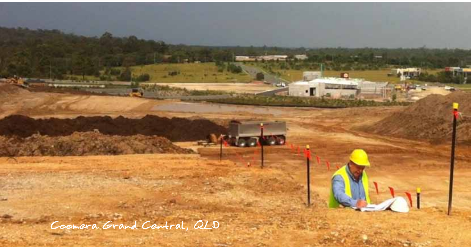
Coomera Grand Central, QLD

Boyds Bay Group is an industry leader in Landscaping and Environmental Science. Our hearts are in the earth and the community. From our ability to integrate with indigenous communities, providing continual staff training, through to delivering international projects to a 7-star standard, we remain an employer of choice. We strive for environmental sustainability in all our work practices, as demonstrated by our involvement in highly regulated industries. The success of our business is fortified by our strict environmental compliance, as seen in rail, mining, and infrastructure projects, and this is proven through legislative compliance and our own internal Integrated Management System. Through different eco systems, our core businesses create wide ranging social benefits via recreation and restoration projects. The success of our business is strengthened by our longevity and our pride in the pursuit of excellence in all our work.