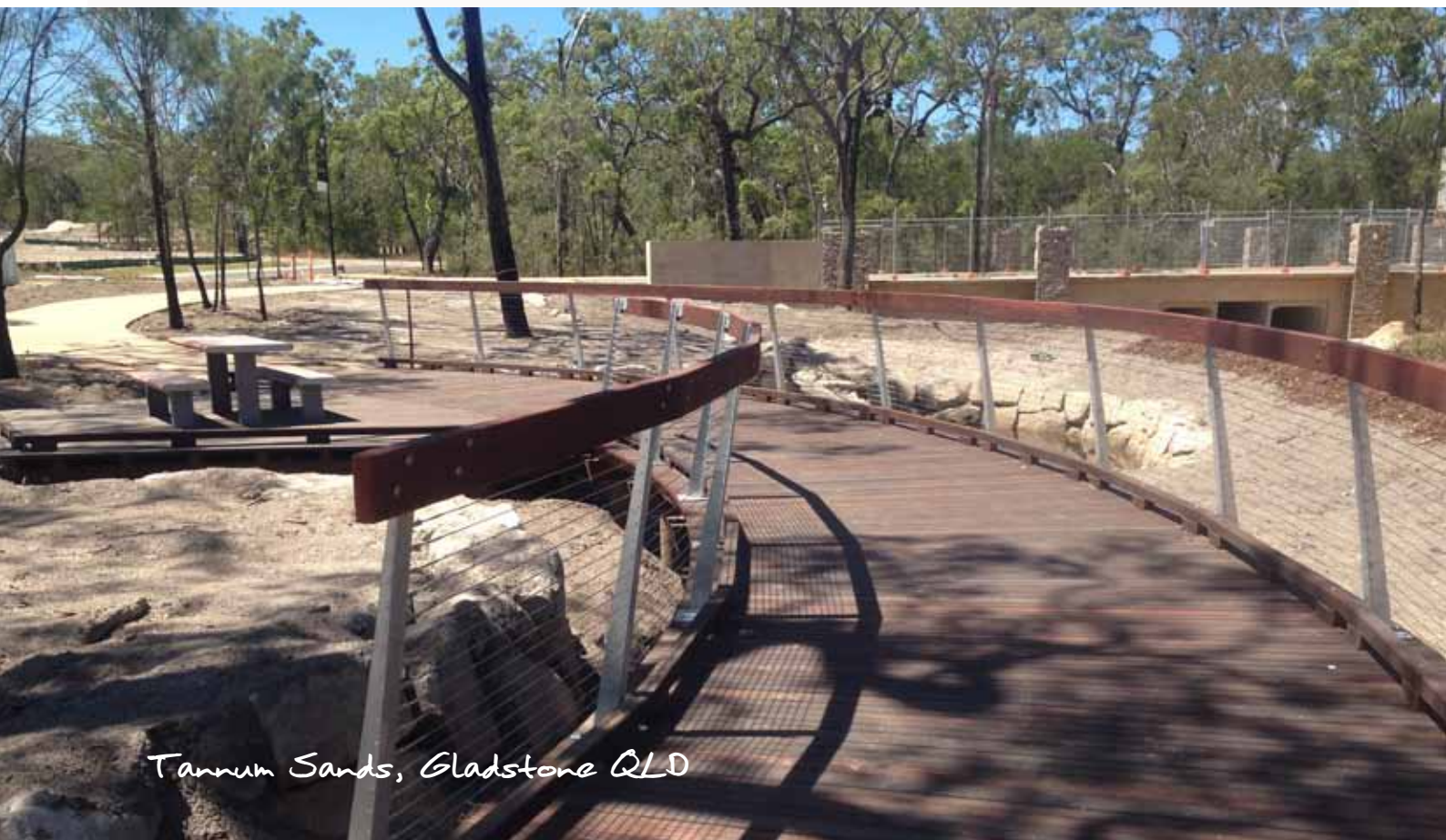
Tannum Sands, Gladstone QLD

The brief for this project was to create complimentary garden areas to these utilities with small or low growing species of grass & groundcovers or small tidy shrubs with distinctive spacing to allow visibility around these living areas as to avoid unexpected meetings between a select group of reptiles and residents. The extreme heat, cold and dry are huge hurdles to overcome in the establishment of these landscapes. Extensive drainage swales to accommodate extreme rainfall when it happens have been constructed to address water runoff issues that can be very challenging for the relatively flat inland townships.