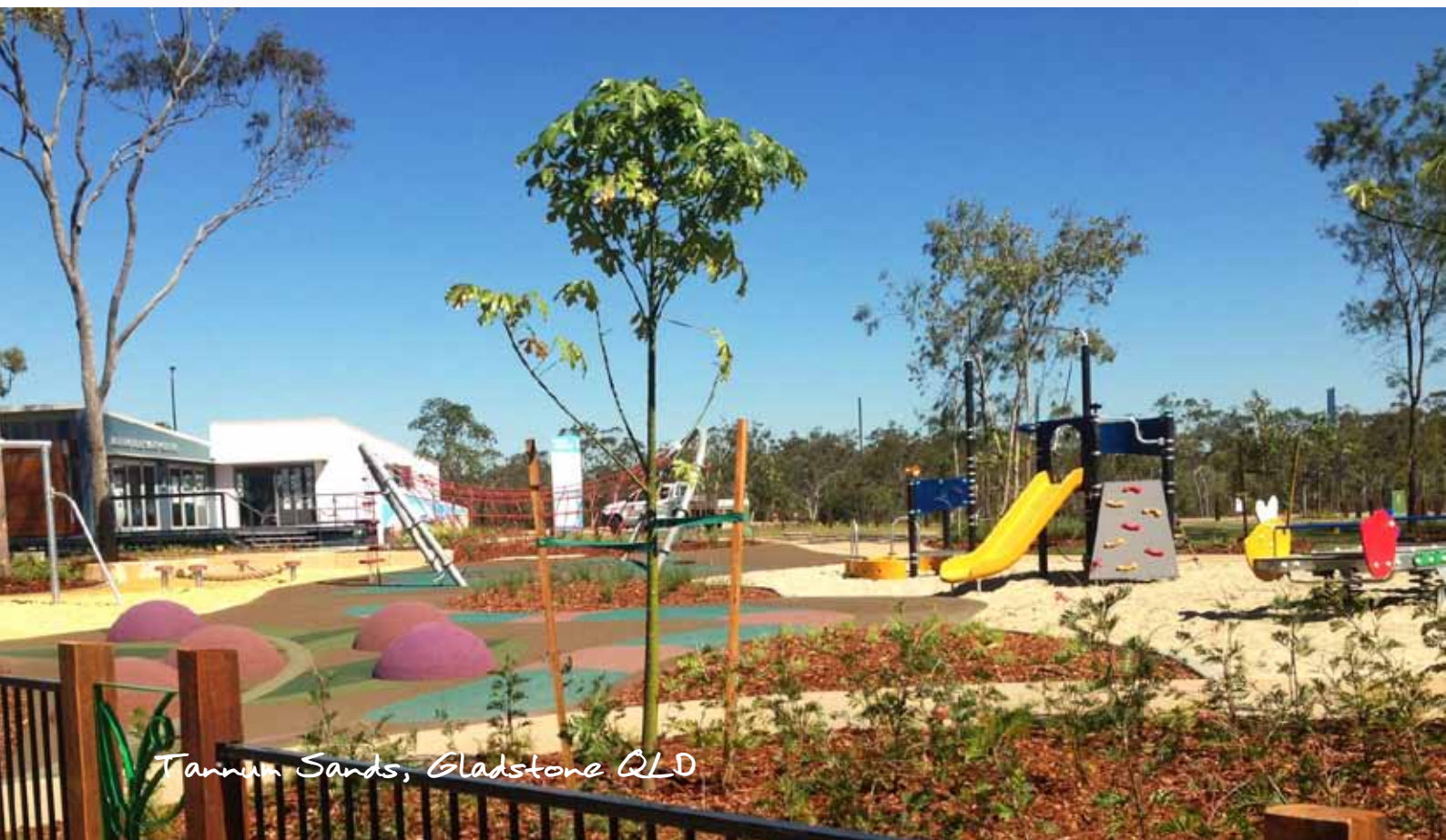
Tannum Sands, Gladstone QLD

This project is a great demonstration of Boyds Bay Group's capabilities delivering whole of life-cycle projects. Boyds Bay ENVIRONMENTAL conducted initial site flora surveys, mapping of mature vegetation, detailed planning for seed collection programs and licence requirements. Boyds Bay NURSERIES were responsible for implementing the propagation management plan to ensure that we generated thousands of plants that were produced to NAT SPEC guidelines, resulting in plants endemic to the region to ensure species diversity is maintained. Boyds Bay LANDSCAPING provided detailed construction works of the project, including architectural features, entrance statements, parks, recreation areas, streetscapes, landscaping and planting of the bio retention systems, drainage swales and other water sensitive urban design features.