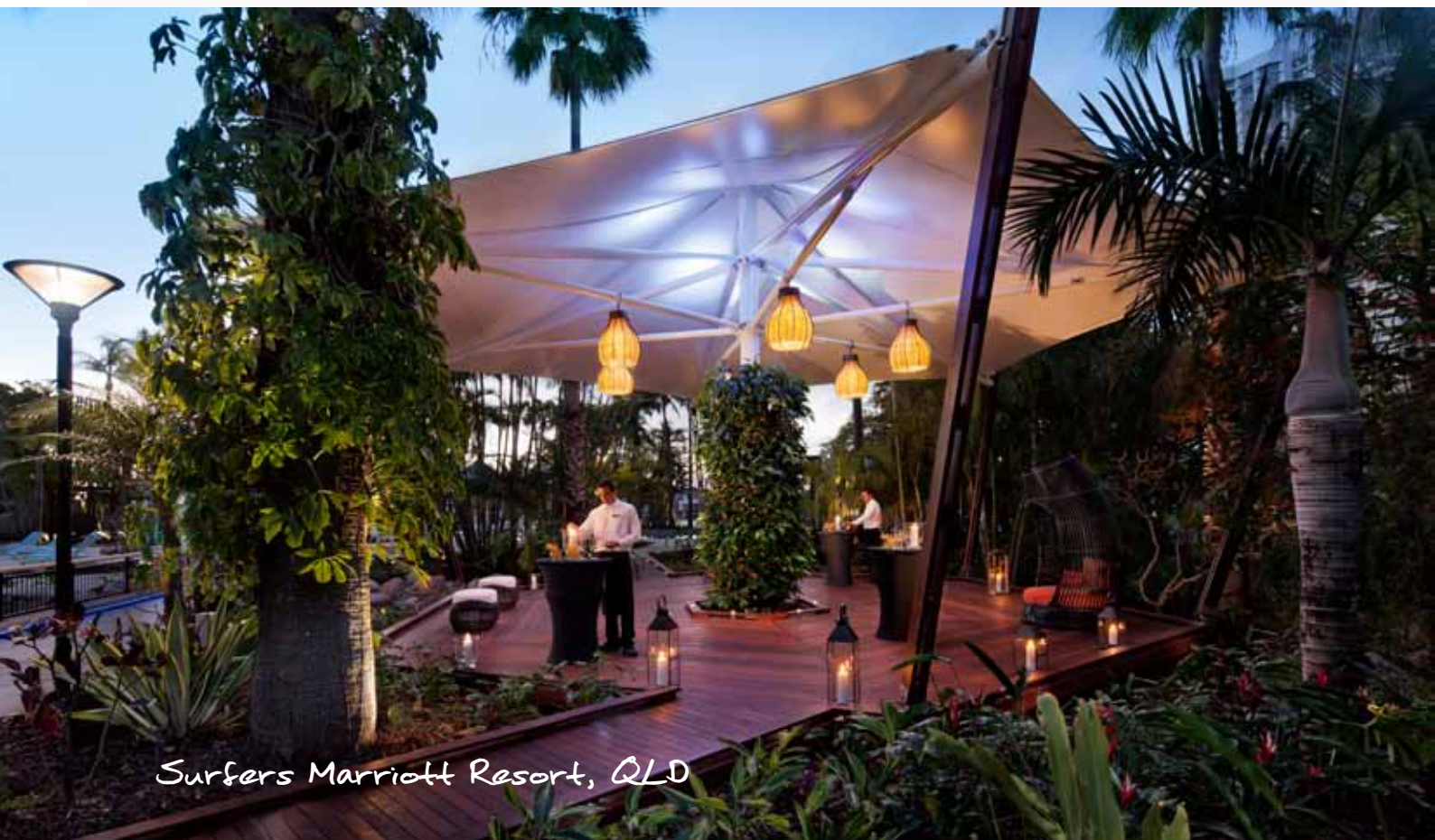
Surfers Marriott Resort, QLD

The beautifully revitalised Surfers Paradise Marriott Resort & Spa is the Gold Coast's stylish playground for all generations. This breathtaking Gold Coast beach resort commissioned Boyds Bay Landscaping to refurbish the existing landscape with lush tropical gardens and decked entertainment areas overlooking cascading waterfalls, rock grottos, spas and the area's only private salt water lagoon where guests can swim and snorkel with an array of tropical fish. Substituting existing plants with those better suited to cope with harsh coastal conditions such as wind, humidity and salt gave the resort the tropical paradise feel necessary to fit succinctly into its native surrounds.