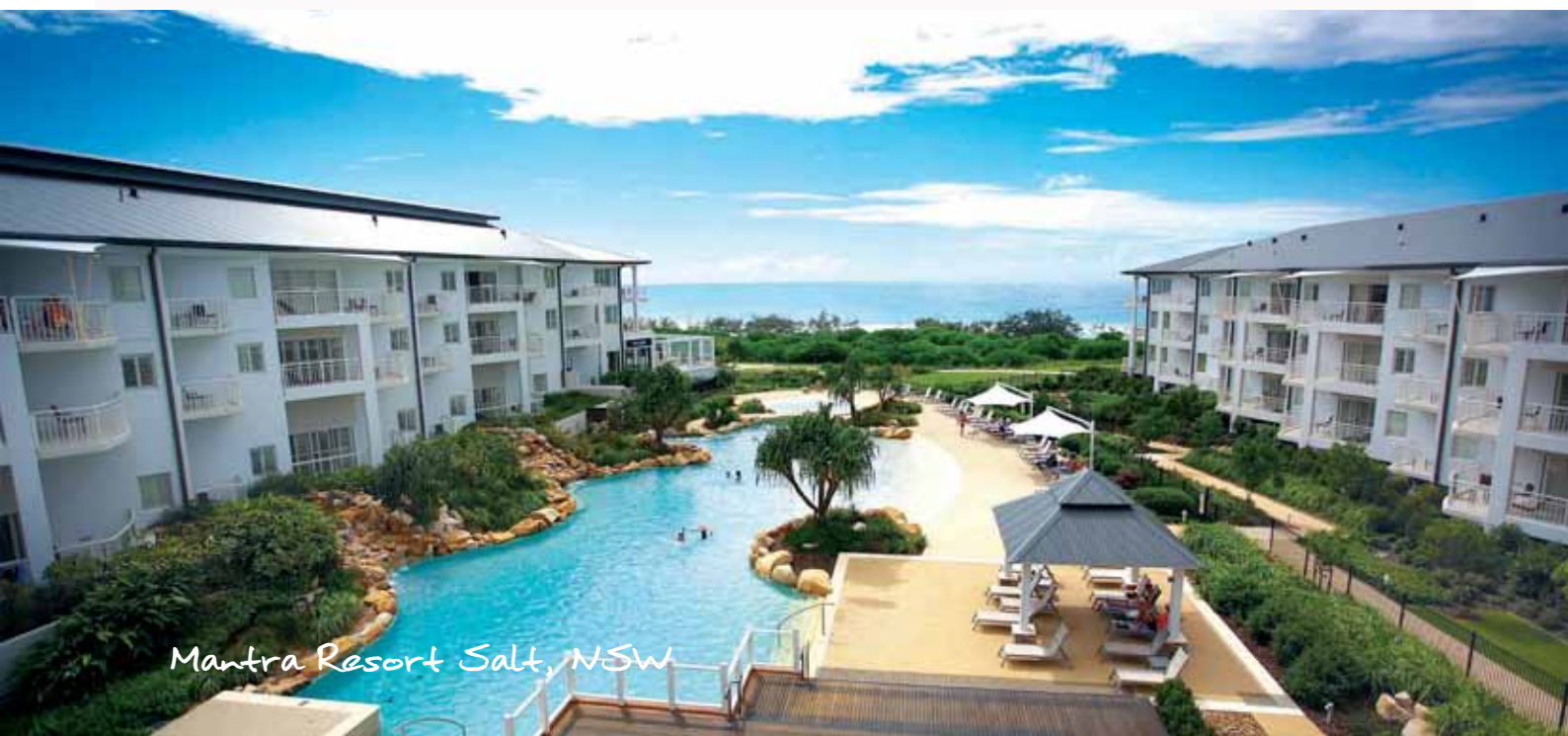
Mantra Resort Salt, NSW

Boyds Bay Group conducted the planning and landscaping for the Sanctuary Cove parks and residential homes. Parks: Given the exclusivity of this classy estate, the landscaping was fundamentally celebrated on all accounts - from waterfront parks and pedestrian walkways, to individual art features and sculptures. Display Homes: All external elements for these display home projects were designed and installed by Boyds Bay Group. Attention was paid to colour, texture and foliage shape, striking a contemporary aesthetic on this prestigious estate. Boyds Bay Landscaping completed a wide range of soft and hard scapes, including block walls, firepits, seating, automatic irrigation; mailboxes; driveways; decorative paths; layered stone walls; timber walkways and large garden areas of tropical foliage.